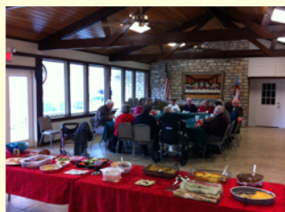
Christmas 2012 at St. Mary's Episcopal Church